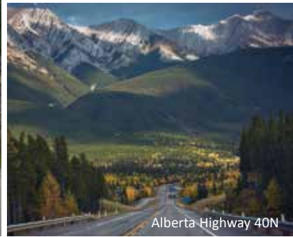
Alberta Highway 40N

Jasper National Park to Dawson Creek, BC (Mile '0' of the Alaska Highway) is approximately 524 km. Highway AB 16, AB 40 N and AB 43 W then connects with Highway BC 2 at the British Columbia and Alberta border.