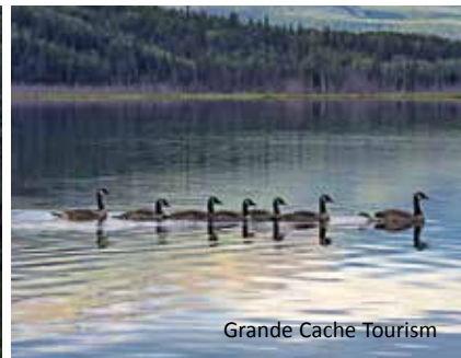
Grande Cache Tourism